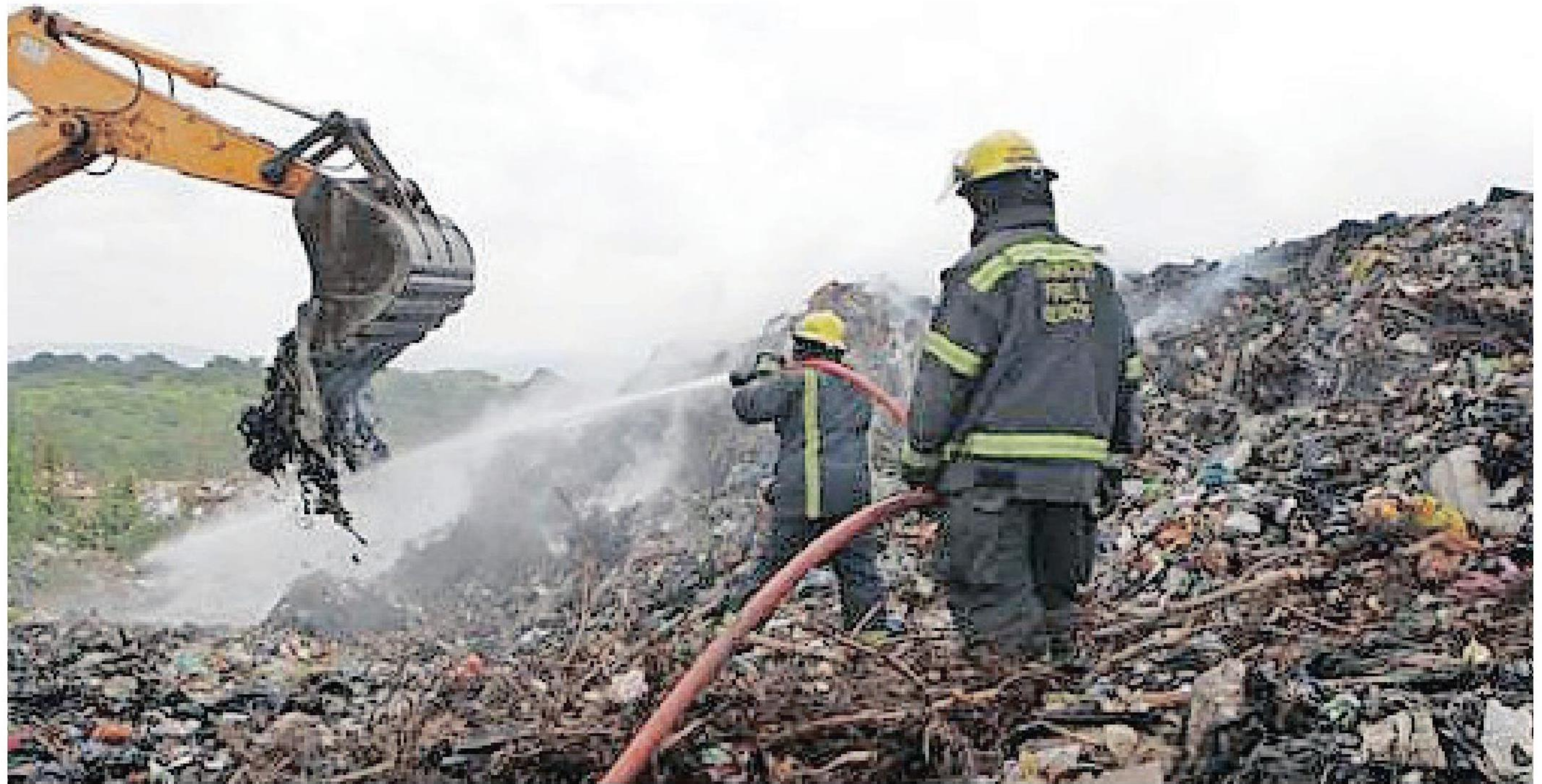
FIREFIGHTERS extinguish a blaze at New England landfill site in Pietermaritzburg last year.

The commission also gathered grievances from Sobantu, Hayfields, Mkondeni, Scottsville residents, the